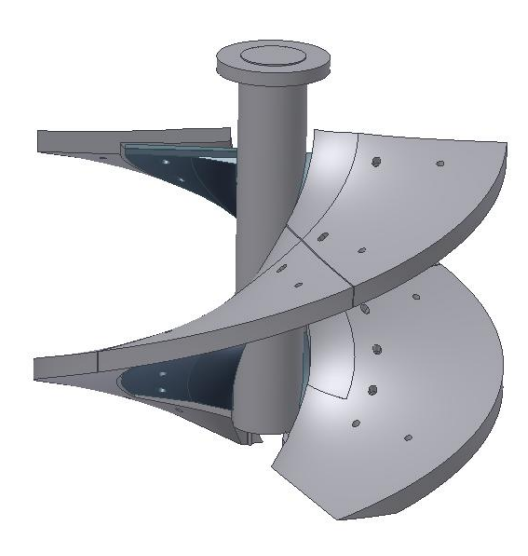
Figure 3 – VTM-3000-WB Screw with Liners

Mill Body Lining: The lower 3050 mm of the body, is the primary action zone of the mill and is lined with Orebed® magnetic liners which consist of 160 mm x 254 mm tiles of magnets embedded in rubber. These tiles ship loose and are magnetically mounted in the field (by others) directly to the shell of the mill without hardware. Small balls and other magnetic material attach themselves to the liners and form an autogenous wear surface. This bed is continually replaced from the charge such that the Orebed® liners should last the life of the mill. The Mill body under the tiles is painted for corrosion resistance. The mill body interior above the Orebed® lining and the overflow launder are covered with abrasion resistant material.