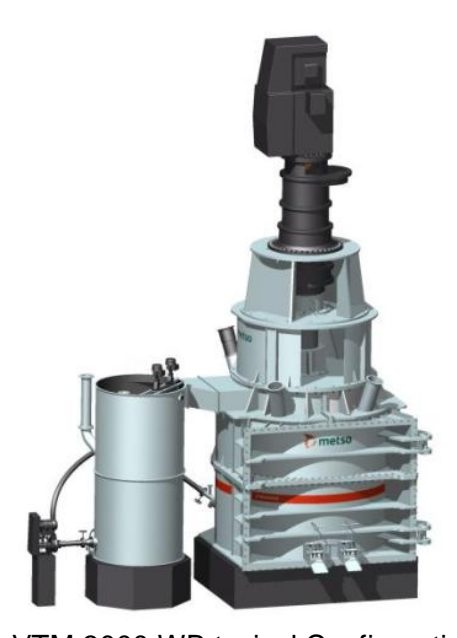
Figure 1: VTM-3000-WB typical Configuration

<u>Mill Lower Body</u>: The lower body is a fabricated A-36 steel cylindrical construction consisting of four (4) Lower Body segments, with the dimensions as noted above, to minimize shipping window. The segments have machined flanges for bolting together in the field (figure 2).